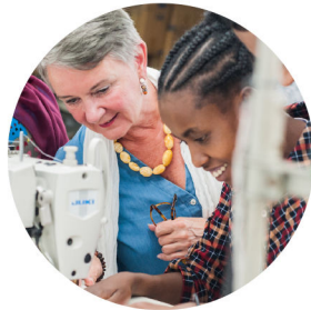
2-month Overseas Training