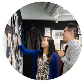
2 to 3 Department Rotations